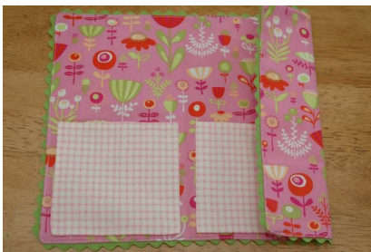
Step 10: Fold the gift pocket so that the pen pocket folds in first and then the left pocket over the top. Press to form creases