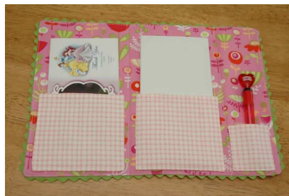
Step 11: Using the creases as a guide, stitch the length of the gift pocket to ensure the creases remain...and voila! All finished!