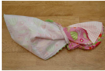
Step 8: Turn folder right side out through gap – using a knitting needle or similar to gently ease out the corners. Press.