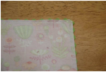
Step 7: Carefully clip corners