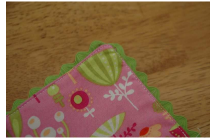
Step 9: Sew around the outer edge, making sure you sew close enough to close the gap left open for turning